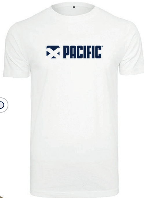
• P526 White