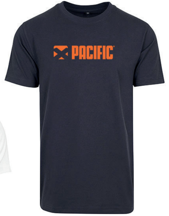
• P523 Navy