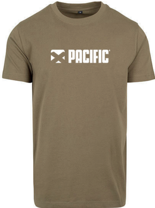
• P524 Olive