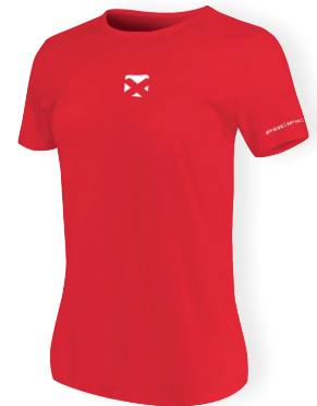
FUTURA TEE, WOMEN