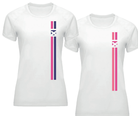
DAYTONA TEE, WOMEN