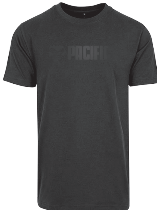
• P528 Black